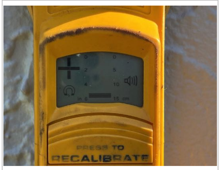
100% reinforced masonry